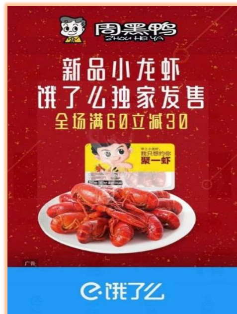
Exclusive Super Brand Festival