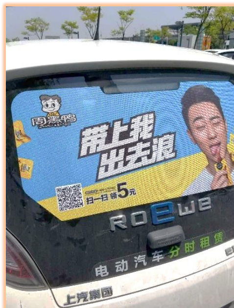
Other Brand Promotion: Car Body Advertising on Shared Rental Cars in Shanghai