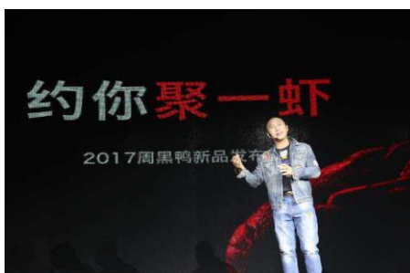
Product launching ceremony