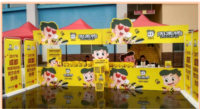
Zhou Hei Ya sponsored the Chengdu Panda Marathon 2017 with great success