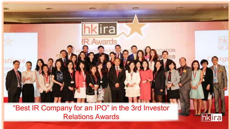
“Best IR Company for an IPO” in the 3rd Investor Relations Awards