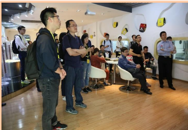
Investors’ site visit during the reverse roadshow in May