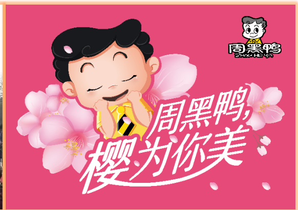
Cherry Blossom Festival by Zhou Hei Ya - 《Zhou Hei Ya, Be Beautiful for You》