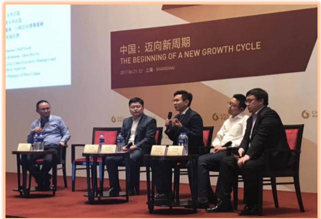
Management participated in investor presentation organized by the securities firm in June